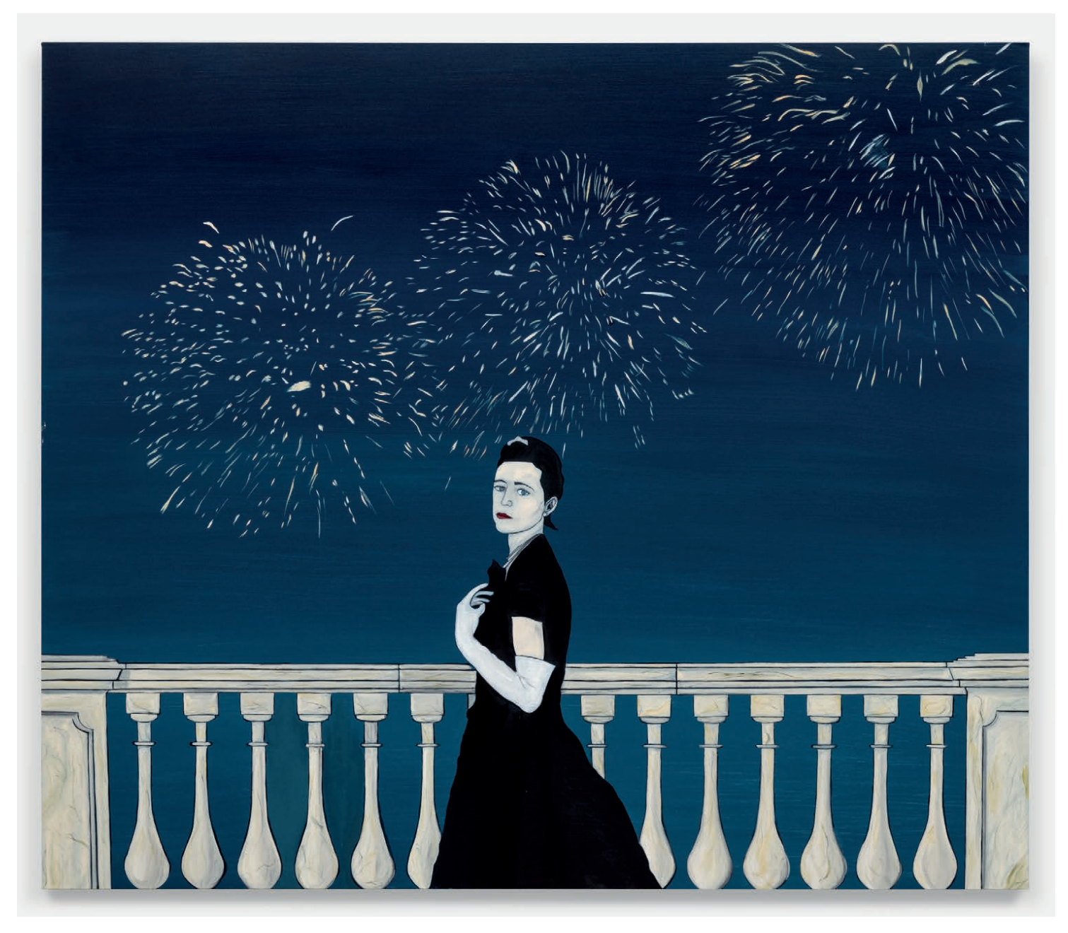
Shimmering Jubilee, 2022 Oil on canvas 72 × 84 in. 182.9 × 213.4 cm